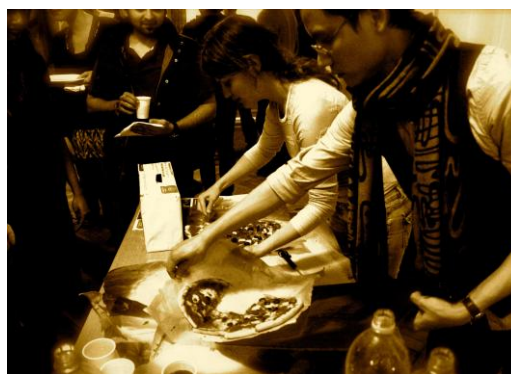
St Edmund's College students selling their pizzas!

COPARS recently hosted its Annual General Knowledge Quiz. Lots of people took part and tackled the 30 questions. From the many correct entries received the 3 lucky winners were: