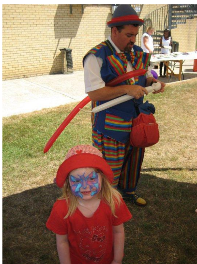
Summer BBQ 2010